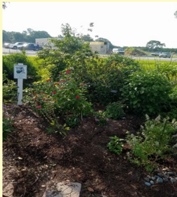
Venice Audubon Rookery, 2021

With the success of the MCFNPS Landscape Grant for public businesses, and the vegetative destruction due to Hurricane Ian, the project was expanded in October 2022 to include home residences affected by the storm. A multitude of homes had their landscaping decimated by wind, water, and the associated equipment traffic to complete home repairs. But we could help! For this season (October 2022-September 30, 2023) only, homeowners within our Chapter's borders (Punta Gorda, Port Charlotte, North Port, Englewood, South Venice) can apply for the Mangrove Chapter Residential Landscaping Grant of up to $100 for rehabilitation, enhancement, or creation of a new yard utilizing Florida native plants. All grant applications can be found on our website, and all applications must be received by April 30, 2023.